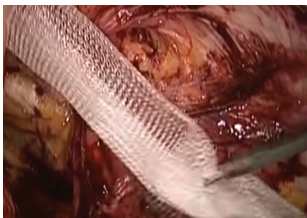
Insertion of mesh in the preperitoneal space.