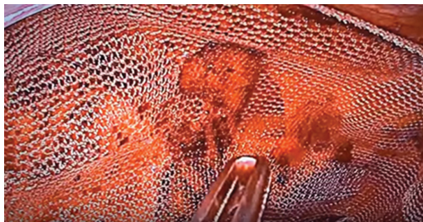
Group B, application of mesh without fixation.

pectineal ligament, medial and lateral to inferior epigastric vessels (Fig. 6). In mesh non-fixation group, the mesh was not fixed (Fig. 7). Closure of the peritoneal flaps was done using absorbable sutures (Vicryl 2/0) in a continuous manner.