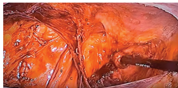
Anatomical structures in the preperitoneal space: (a) vas, (b) spermatic vessels, (c) triangle of doom, (d) inferior epigastric vessels, and (e) Cooper's ligament.