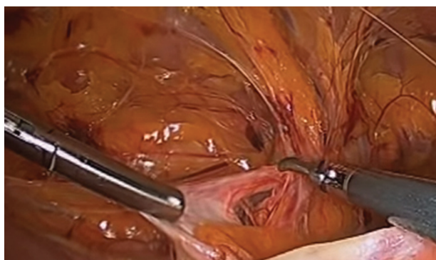
Reduction of hernial sac.